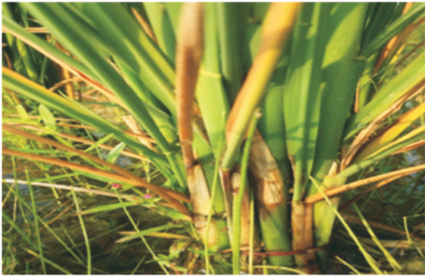
Sheath blight symptoms