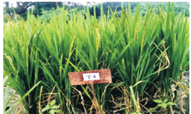
T4 P. fluorescens + Bacillus subtilis (10%)