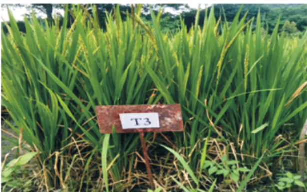
T3 P. fluorescens (10%)