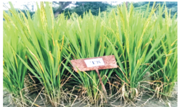
T8 Carbendazim (0.05%)