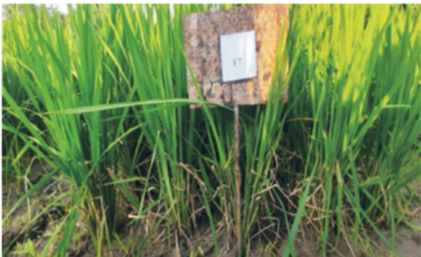
T7 Carbendazim (0.1%)