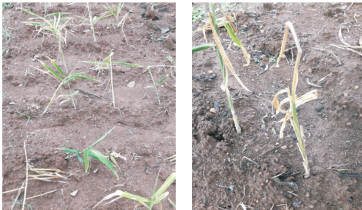
Fig.2.Ginger plot affected with Rhizome rot